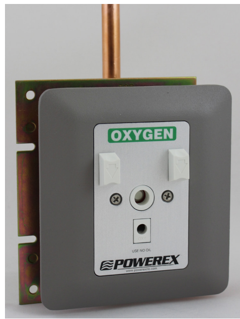
Part Number PX-ALN91XA1124 shown

The name of the gas service shall be permanently marked on the outlet bracket and the outlet. The outlet's rough-in supply tube shall be a 7 inch (18 cm) length of ½ OD copper