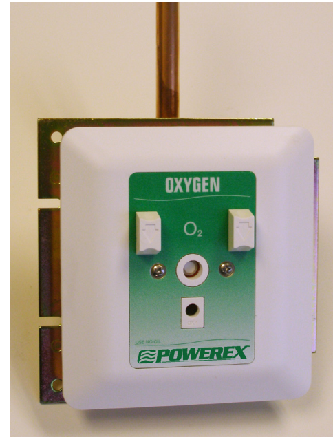
Part Number PX-XA1124 shown

The name of the gas service shall be permanently marked on the outlet bracket and the outlet. The outlet's rough-in supply tube shall be a 7 inch (18 cm) length of ½ OD copper